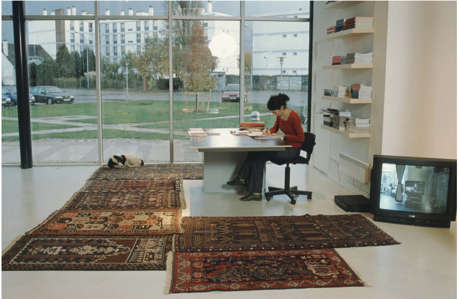
Exhibition view of "Be Seeing You", Curator: Xavier Franceschi. CAC Brétigny, France, 2000.